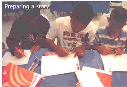
Preparing a story