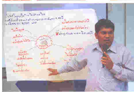
Preparing a story board