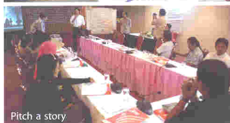
Pitch a story