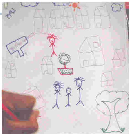
Drawing and mapping