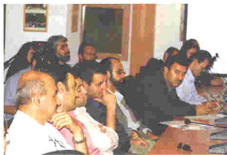
Workshop participants at the UN briefing