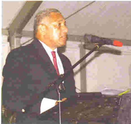
Commodore Josaia Voreqe Bainimarama, the Prime Minister of Fiji