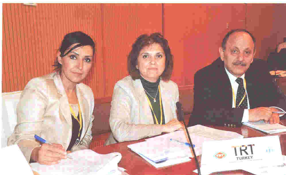
Representatives of TRT-Turkey

BTv-Mongolia - a new business news channel based in Ulaanbaatar - was admitted as an Associate Member.